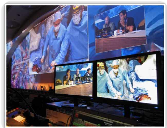
Real-time Event Webcasting

Each presentation can either be streamed live in real-time or captured and uploaded as web-ready video to our proprietary video hosting platform within 24 hours after your event ends. Once uploaded, content will be displayed in an easy to access video catalog that is fully searchable.